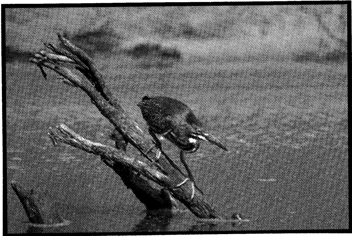
Green Heron