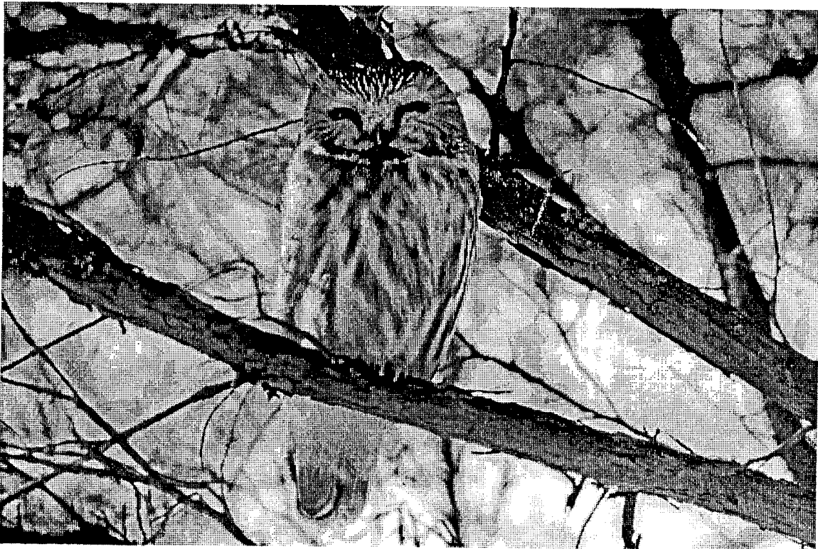
Northern Saw-whet Owl, Amherst Island